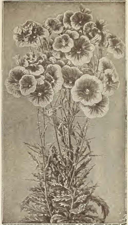
Salpiglossis variabilis superbissima

Single Annual Mixed. Blooms the first year. Pkt., 10c.