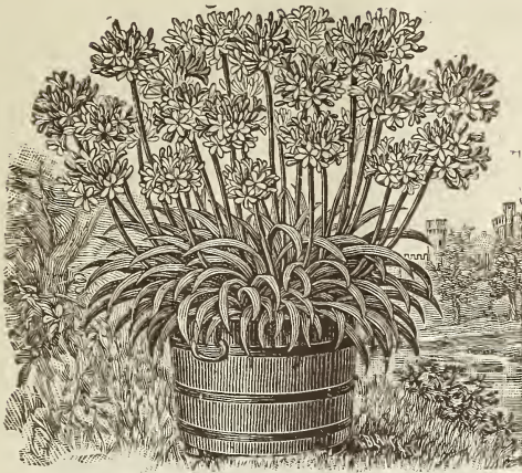
Agapanthus Umbellatus (Blue Lily of the Nile). A lovely, ornamental plant, grand for piazzas or lawns; grown in pots or tubs. Flower spikes 2 to 3 feet tall, bearing clusters of rare azure blue. Each' 50c.; 3, $1.40.