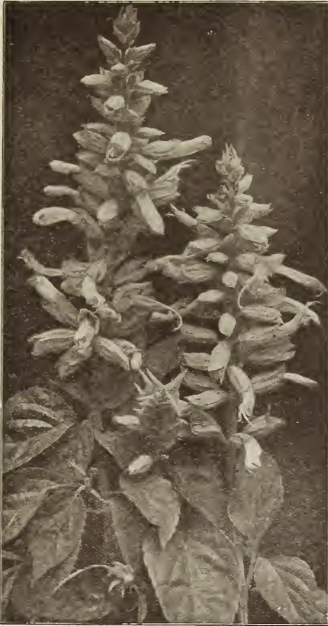
Salvia (Flowering Sage)

FARINACEA A. (Exquisite Blue Salvia). That rare tint among flowers of a beautiful clear morning sky. It flowers in July and August, keeping in bloom till frosts. Pkt., 15c; \frac{1}{8} oz., 50c.