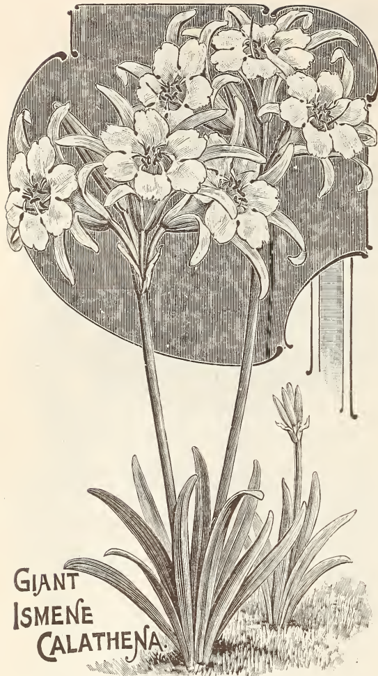
GIANT ISMENE CALATHENA