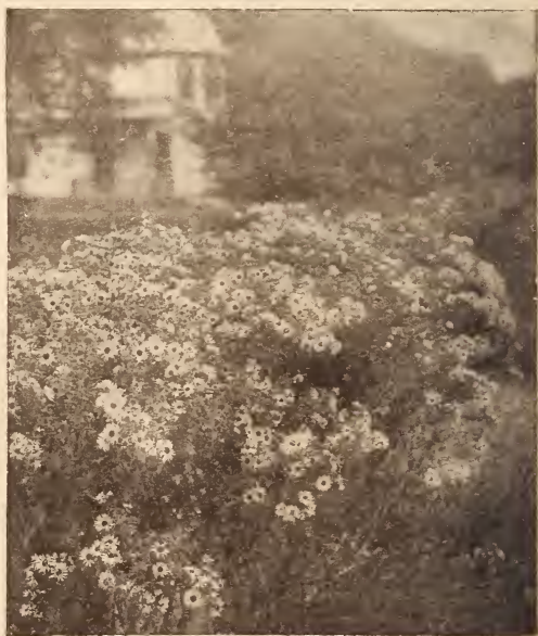
A Wild Flower Nook

Blend of California Wild Flowers for Shady Places. Pkt., 10c.; ¼ oz., 25c.